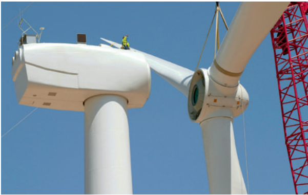
In conjunction with imc CANSASflex, distributed measurements can be carried out quickly and safely.