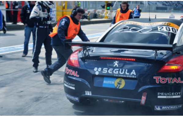
Thanks to its lightweight, compact design, the imc BUSDAQflex is ideal for vehicle testing.

The new data logger is perfectly complemented by the imc CANSASflex series measurement modules. Thanks to the click mechanism, the modules can be directly attached to the logger without tools and cables. In a very short time, a complete measurement system that can synchronously record and store all data can be made from a pure field bus logger.