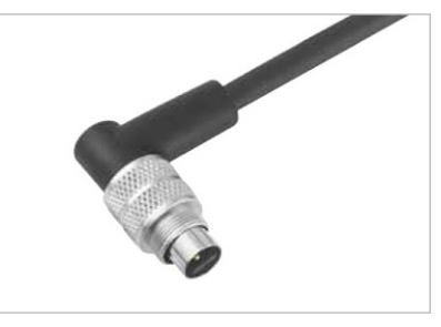
Right Angle Cable, 2m, PVC Part # EL-CAB–M9X7MRA-2