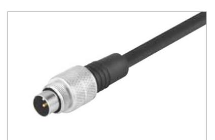
Straight Cable, 2m, PVC Part # EL-CAB–M9X7MS-2