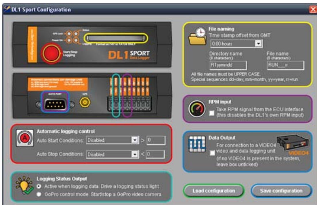
Simple to set up with the new user friendly configuration software

What our GPS data loggers do is more than just collect the data, they allow all the data to be referenced to not just time, but a position on the track. This allows you to interpret the data in a meaningful and understandable way, referenced clearly to the real world: Pick a corner and see how you braked, how much grip you used and where, then how you exited. Compare what you did on your fastest time through the sector and learn where you can go faster.