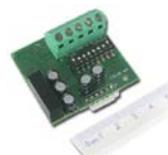
LC4 RS485/232 Communications (supports MODBUS RTU, ASCII, MANTRABUS 1 & MANTRABUS 2)