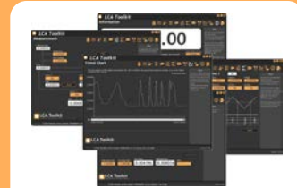
New LCA Toolkit Software